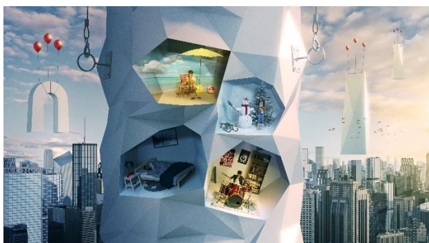
New foamable Achieve™ Advanced Polypropylene is an easily and affordably processed solution for high volume applications

In automotive parts (such as headliners, ducts, floor liners), Achieve™ Advanced PP6302E1 delivers the stiffness that allows vehicle manufacturers to maintain critical performance properties while reducing weight and increasing fuel efficiency. The foam structure can also provide benefits such as heat insulation and sound dissipation for a more comfortable ride.