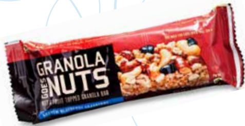
Granola Goes Nuts Silver Award Winner - Technical Innovation Printpack