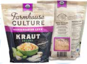
Farmhouse Culture Kraut Silver Award Winner - Expanding the Use of Flexible Packaging ProAmpac