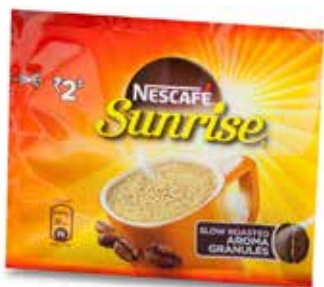
Nescafe Sunrise Foil Instant Coffee Sachet Silver Award Winner - Sustainability Flex Films (USA) Inc.

Henkel Corporation is a leading supplier in the flexible packaging industry. Henkel develops, manufactures and markets adhesives, primers and coatings for the flexible packaging and carded packaging industries.