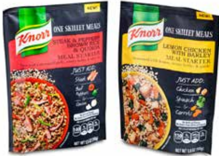
Knorr One Skillet Meals Gold Award Winner - Printing and Shelf Impact American Packaging Corporation