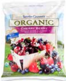
Sunrise Growers Organic Cherry Berry Fruit Blend Gold Award Winner - Printing and Shelf Impact ProAmpac