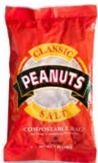
Compostable Peanut Bag Gold Award Winner - Sustainability TC Transcontinental Packaging