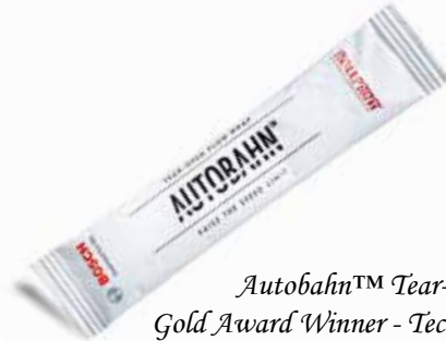
Autobahn™ Tear-Open Flow Wrap Gold Award Winner - Technical Innovation Rollprint Packaging Products, Inc.