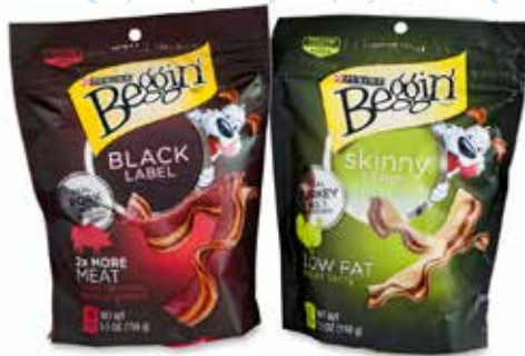
Beggin' Strips - Black Label and Skinny Strips Silver Award Winner - Printing and Shelf Impact Printpack