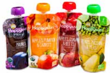
CHEER PACK® Clear Pouches Silver Award Winner - Packaging Excellence Cheer Pack North America