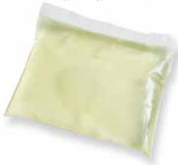
Eco-Asept Silver Award Winner - Sustainability Liqui-Box Corporation