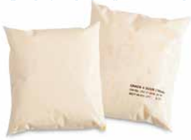
FlexFlow Silver Award Winner - Sustainability Liqui-Box Corporation